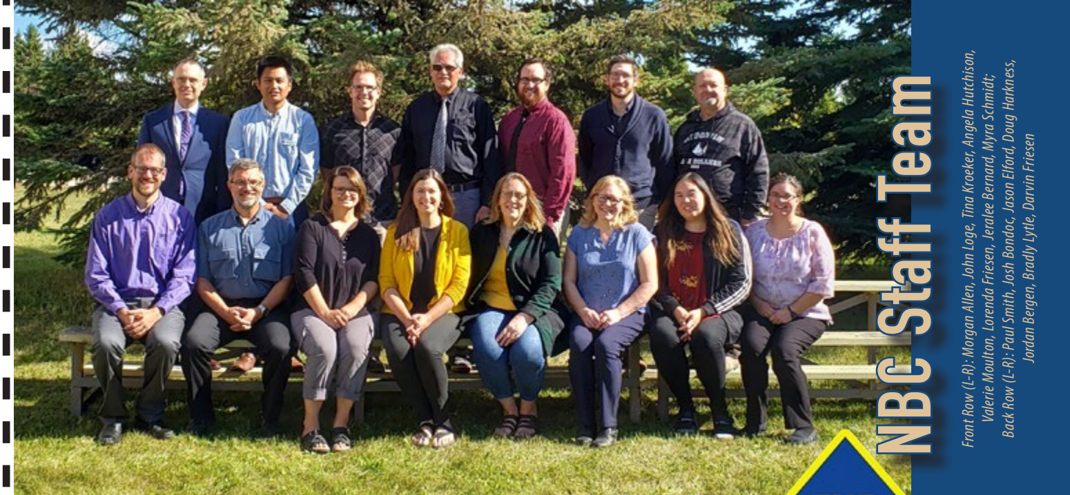
NBC Staff Team

This year a particular highlight was the young adult mentoring I was able to participate in.