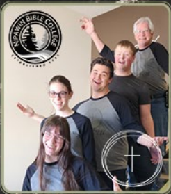
NBC DRAMA TEAM