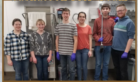
Saskatoon FMP Team