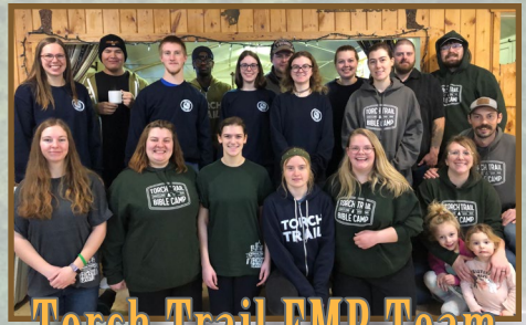
Torch Trail FMP Team

"I saw God teaching me in the area of servanthood through serving other people while being tired, and serving with an attitude of love rather than seeing it as a mandatory."